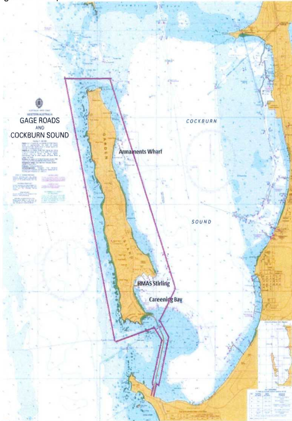
Figure 1 Project location showing HMAS Stirling, Careening Bay, Armaments Wharf and the naval waters boundary