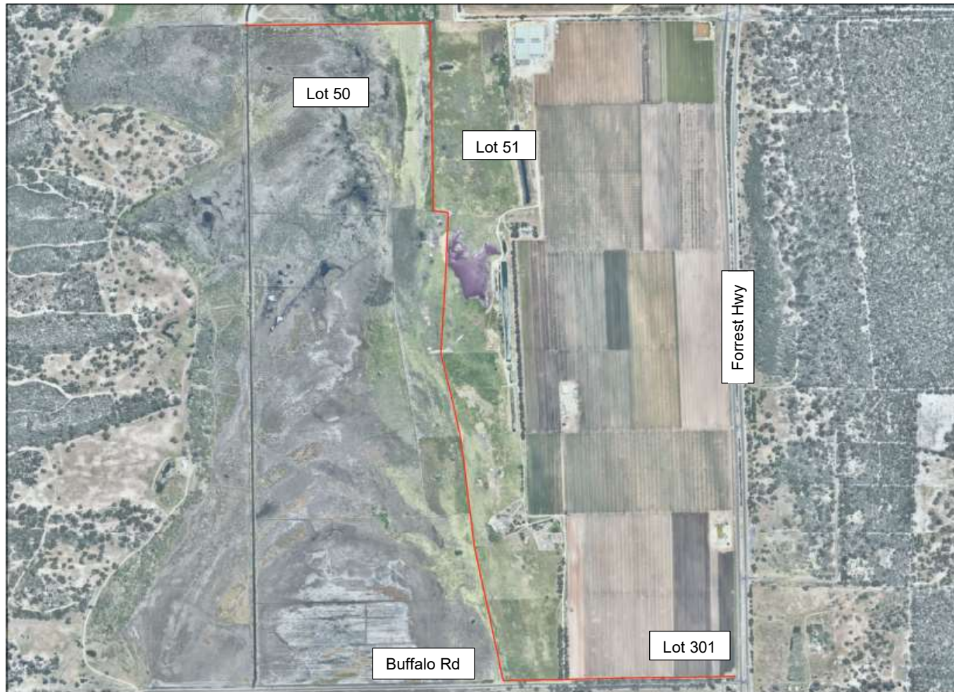
Figure 1 – Harvey Water Brine Pipeline section for minor and preliminary work