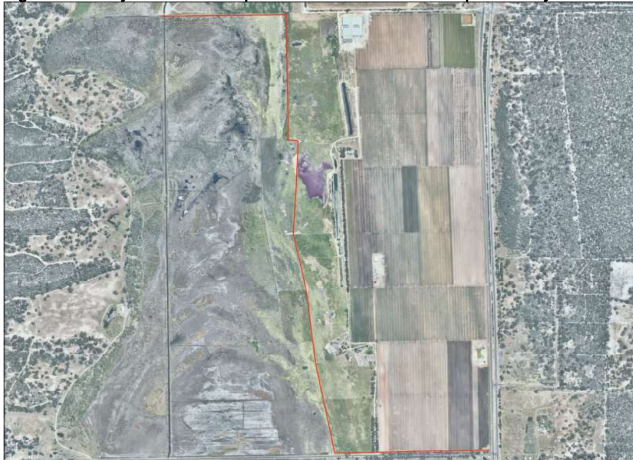
Figure 1 Harvey Water Brine Pipeline section for minor and preliminary work