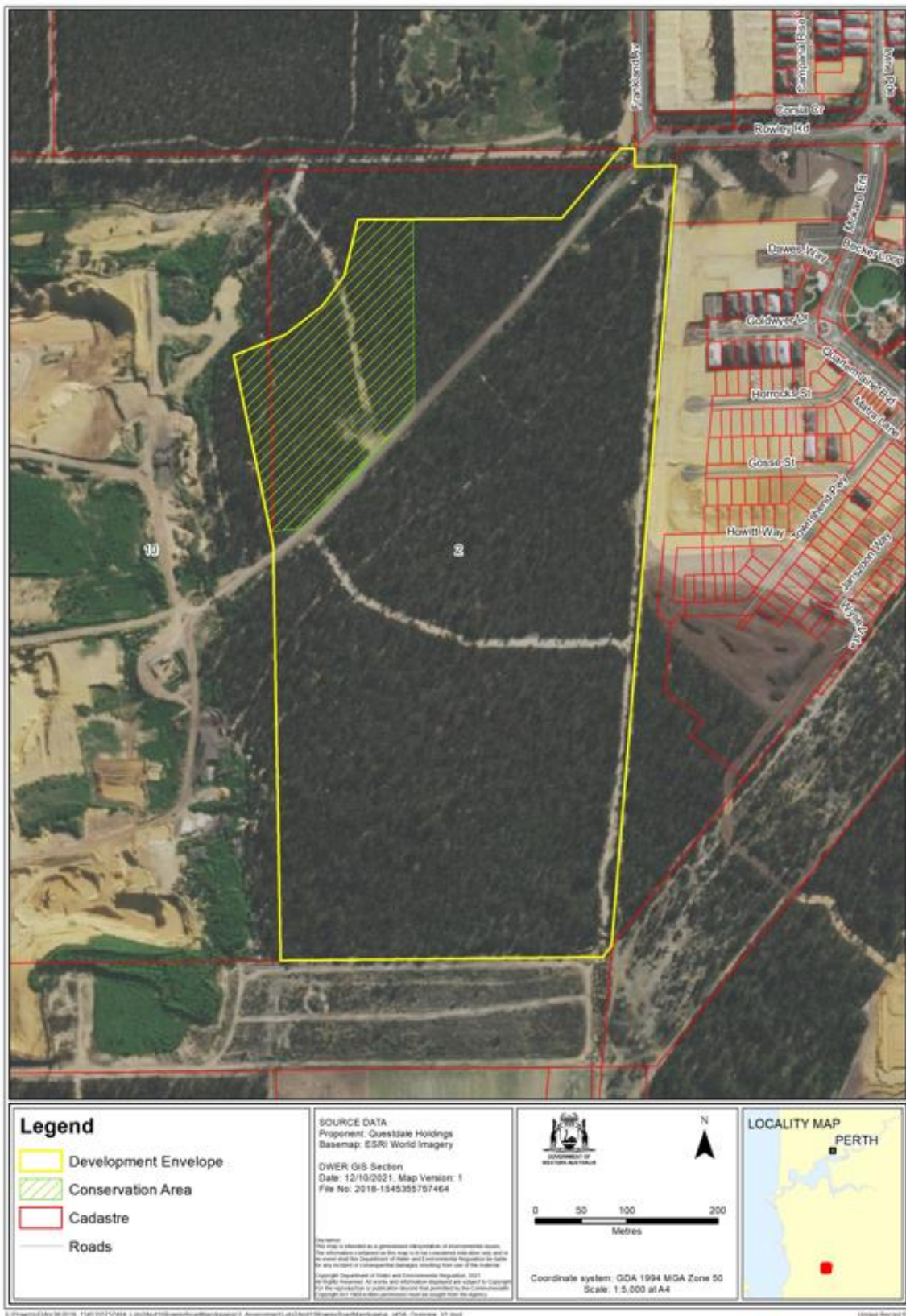
Figure 1 - Amended Proposal Area