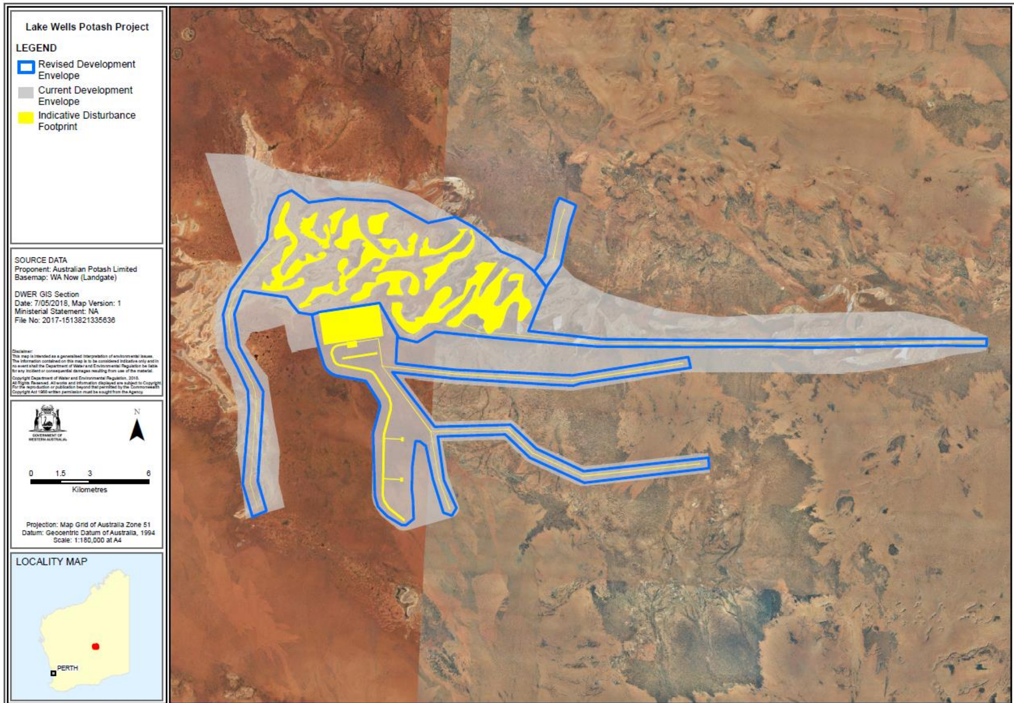
Figure 1 – Changes to referred Project Development Envelope