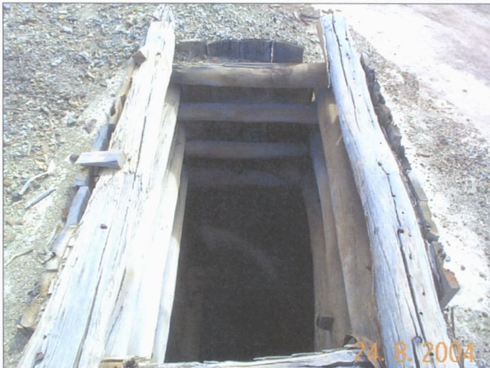
Timber supports that surround the open Harbour View Shaft It is not deemed safe to enter any of the open shafts within the Kundip Lease area