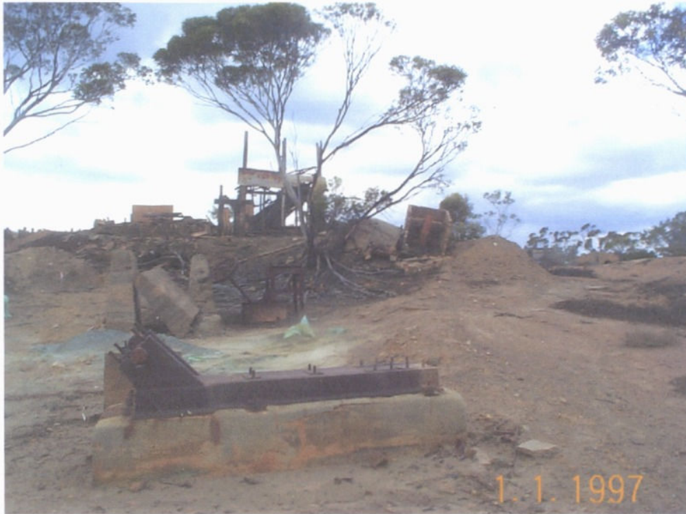
Remains of the Harbour View Mill Kundip Mining Area - 2004