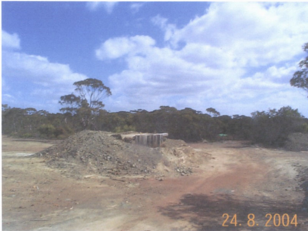
Looking West towards the timber supports that surround the Harbour View Shaft The Shaft opening is encompassed by a small mound of stockpiled dirt Kundip Mining Area - 2004