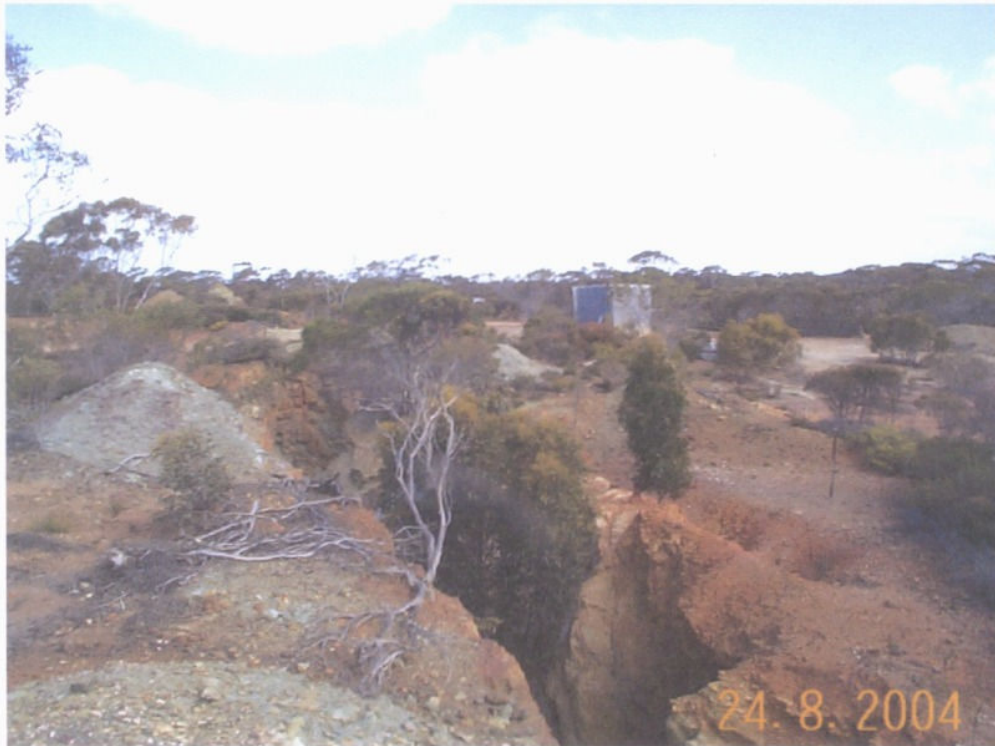
Substantiation of historic disturbance to the Harbour View mine site area Looking WSW toward the tin shed adjacent to the Harbour View Shaft