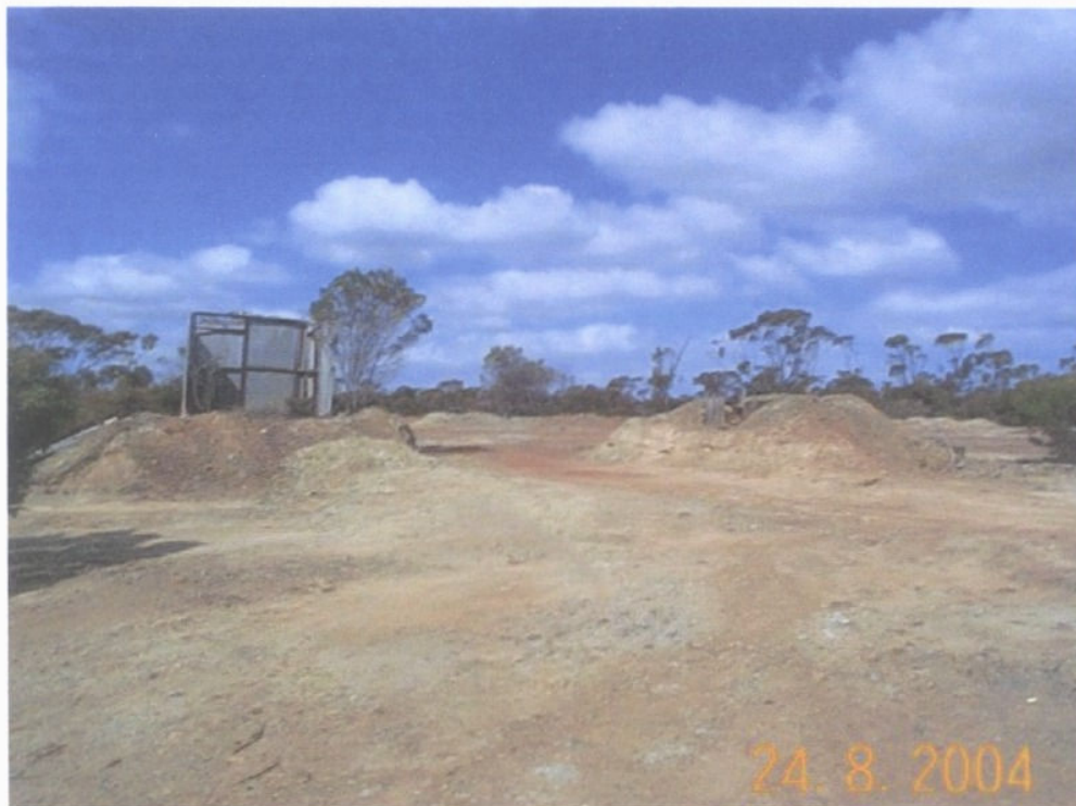
View looking East towards the Tin shed and the Harbour View Shaft Kundip Mining Area - 2004