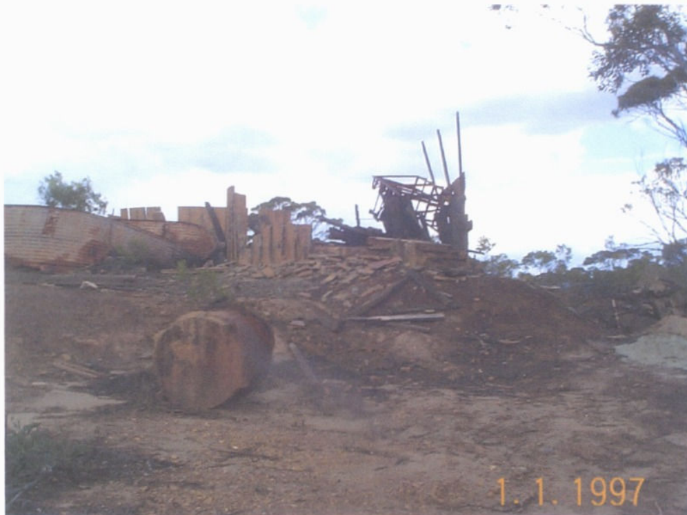
View looking South towards evidence of historic disturbance These vestiges of the Harbour View Mill will not be disturbed by the proposed Phillips River Gold Project