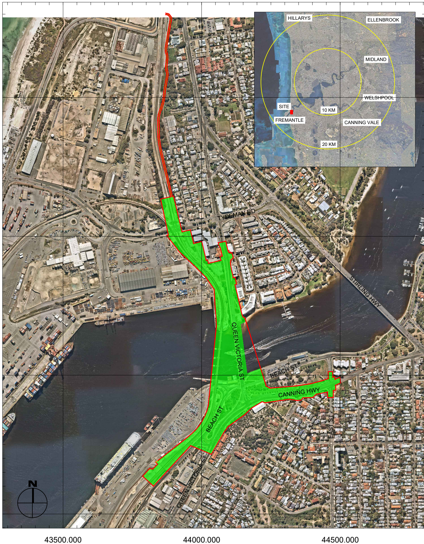
Figure 3: Development Envelope and Proposed Disturbance Footprint