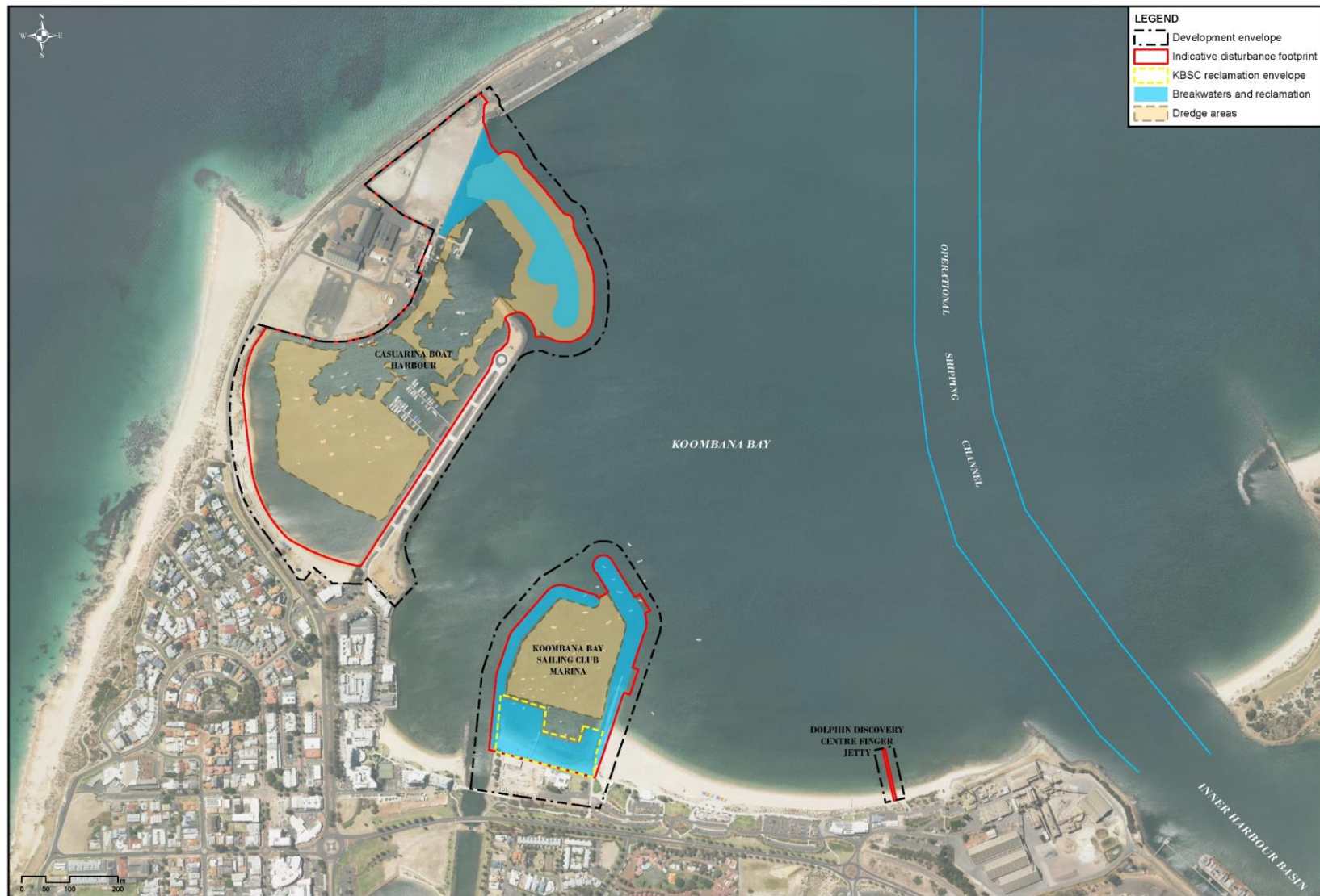
Figure 1 Development envelope, indicative disturbance footprint and marine elements