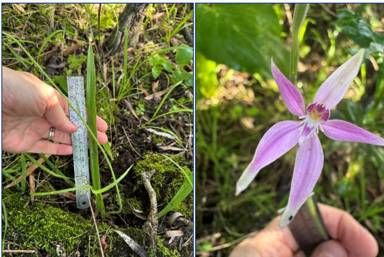
Plate 1. Caladenia latifolia leaves (left) and flower (right) recorded 17 September 2025

There were no limitations or constraints upon this survey (Table 1).