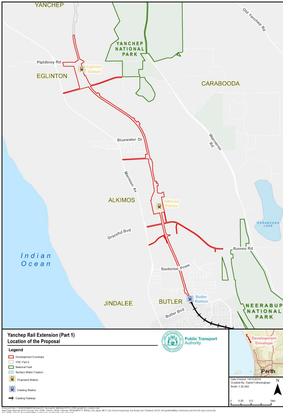
Figure 2-1: Project location