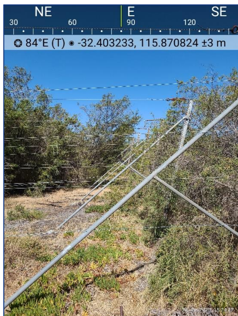
Plate 1. Wire structure

Should you require clarification, please contact the undersigned on 0407 192 022 or by email rpratt@jbsg.com.au .