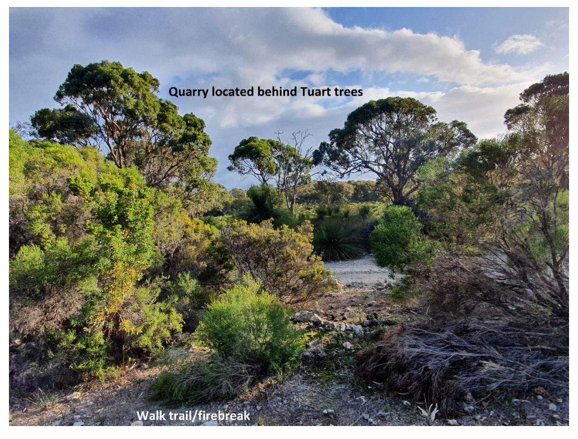
Plate 5. Looking west, towards proposed quarry.