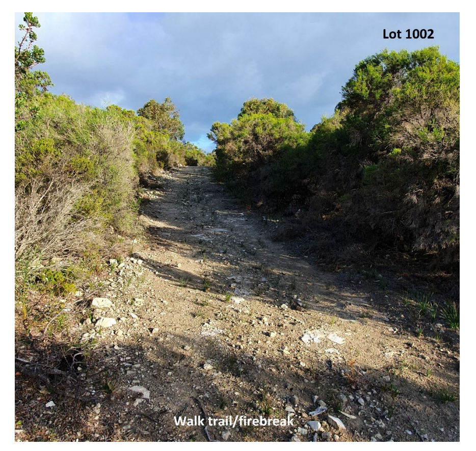
Plate 6. Looking south, with Lot 1002 on the right.