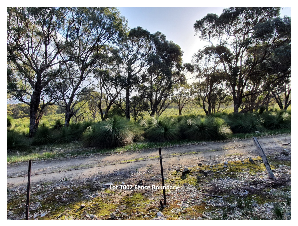
Plate 3. Looking west towards proposed quarry. Tuarts provide screening.