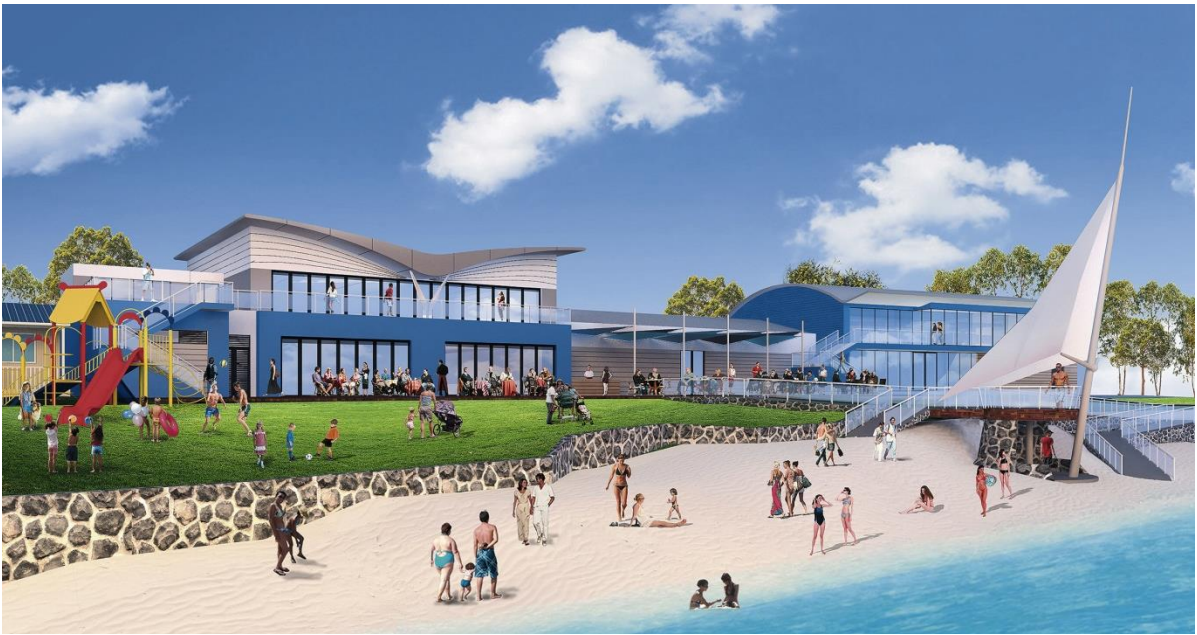
A glimpse of what the Dolphin Discovery Centre could look like if redeveloped.