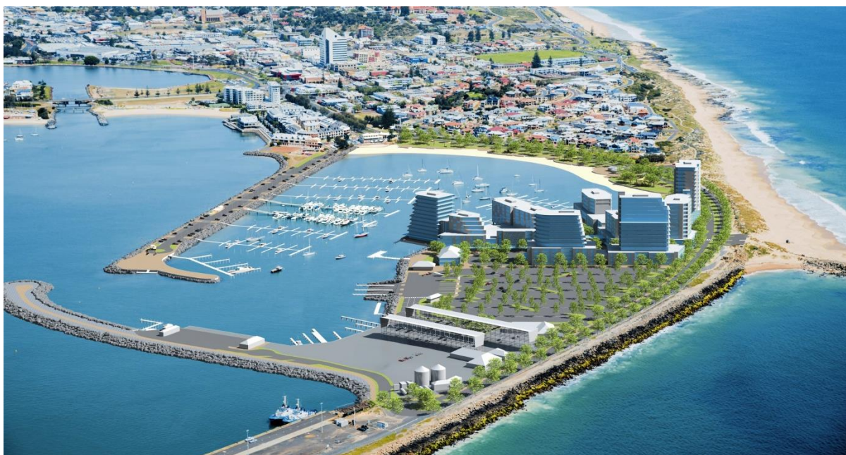
This image indicates the development possible at Casuarina Boat Harbour.