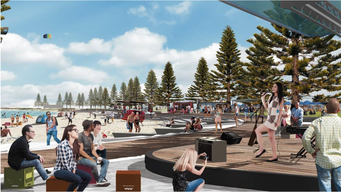
An amphitheatre is proposed for Koombana Bay foreshore.