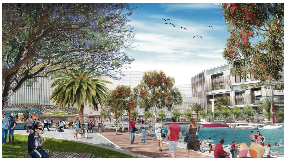
An artist's impression brings to life the vision for Casuarina Boat Harbour.