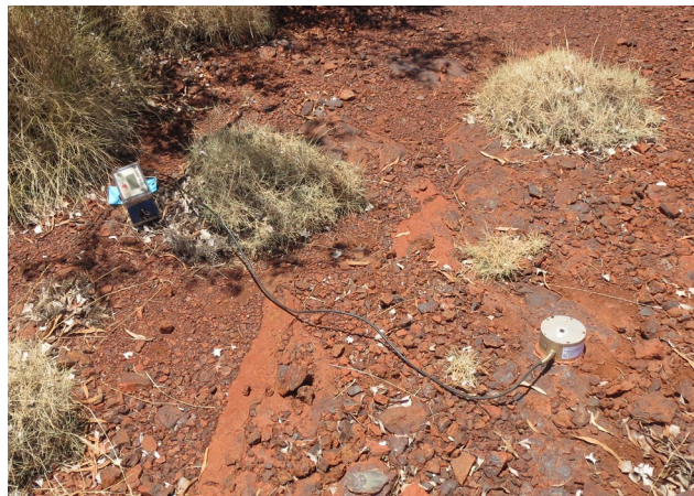
A geophone glued to rock mass, ready to capture blast vibration data

Ground vibrations are generated from blasting buried explosives, and these travel through the ground in much the same way that sound travels through air. There are several types of waves generated (e.g. compressive, shear and surface waves), and the sum of these waves can be detected and measured using geophones, accelerometers or other sensors with appropriate data acquisition equipment.