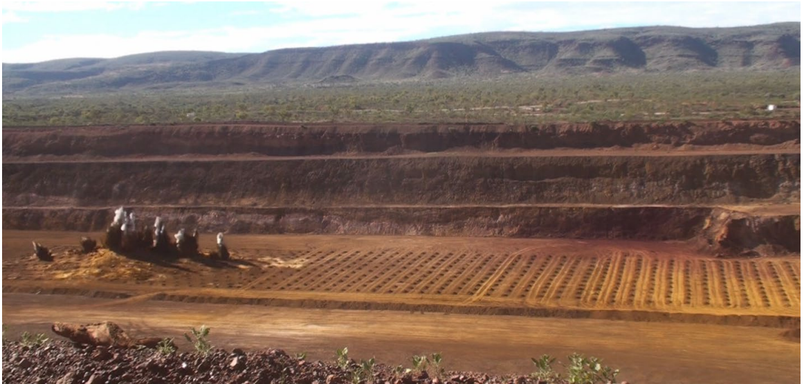
Production blast at Hope Downs 1 mine