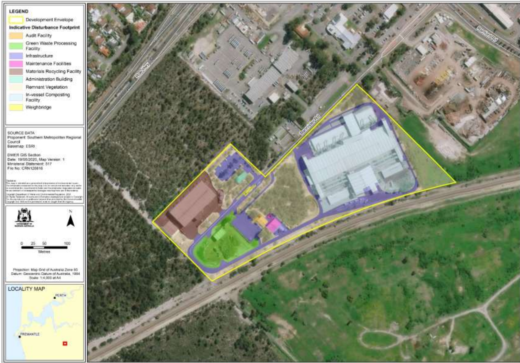
Figure 2: Development envelope