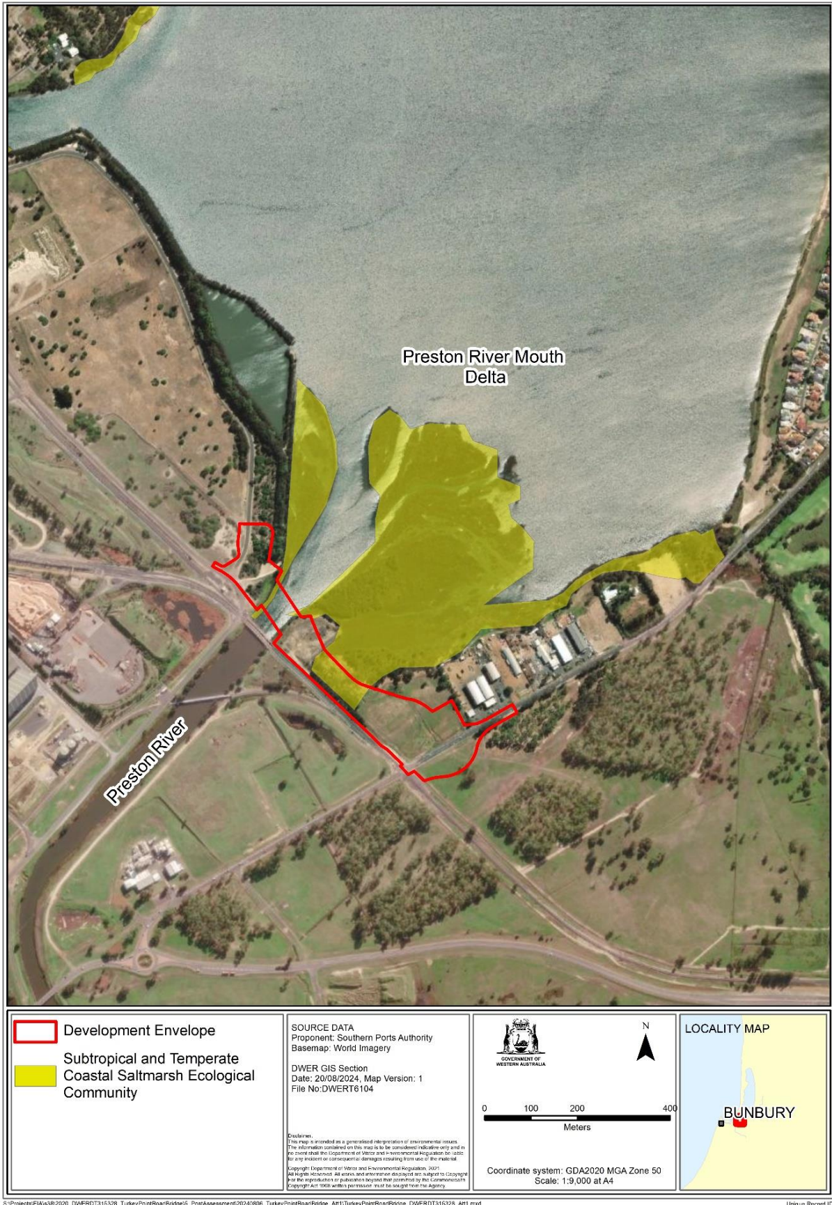
Figure 1: Proposal development envelope and location of the Subtropical and Temperate Coastal Saltmarsh Priority Ecological Community.