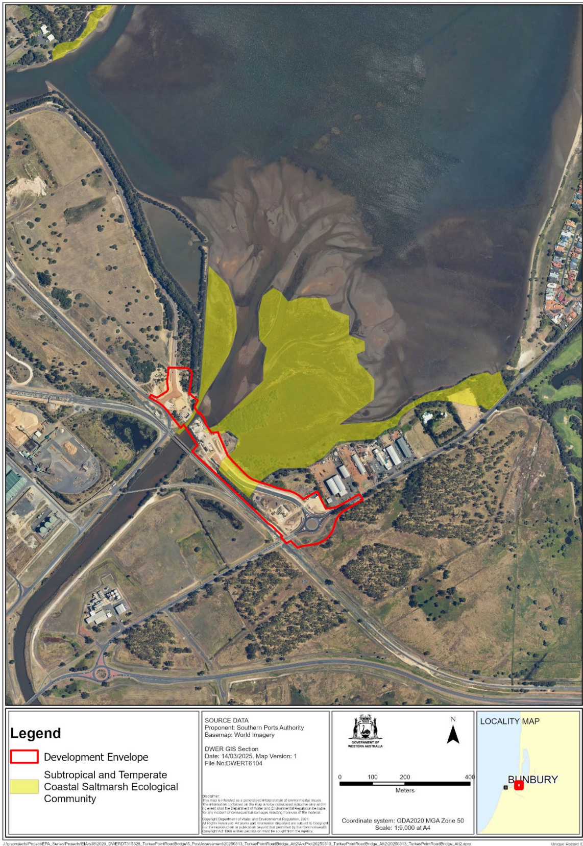
Figure 1: Proposal development envelope and location of the Subtropical and Temperate Coastal Saltmarsh Priority Ecological Community.