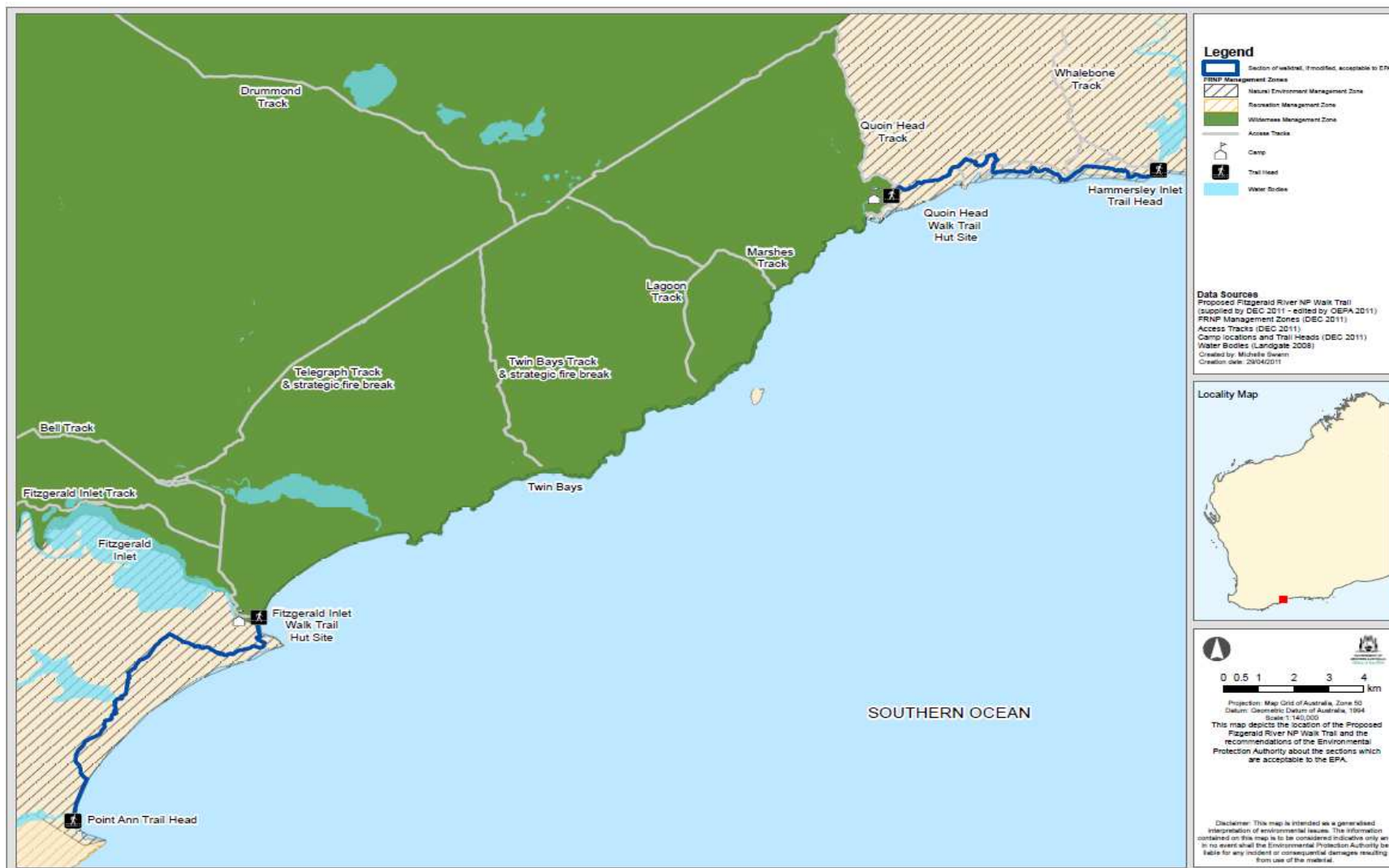
Figure 1 Approved Extent of Coastal Walk Trail and Facilities between Point Ann and Hamersley Inlet in the Fitzgerald River National Park (no development within Wilderness Management Zone).