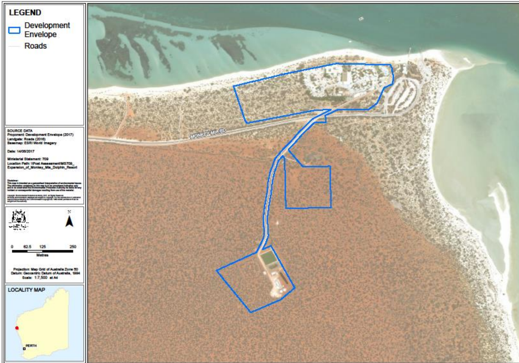
Figure 1. Development Envelope for the Expansion of the Monkey Mia Dolphin Resort