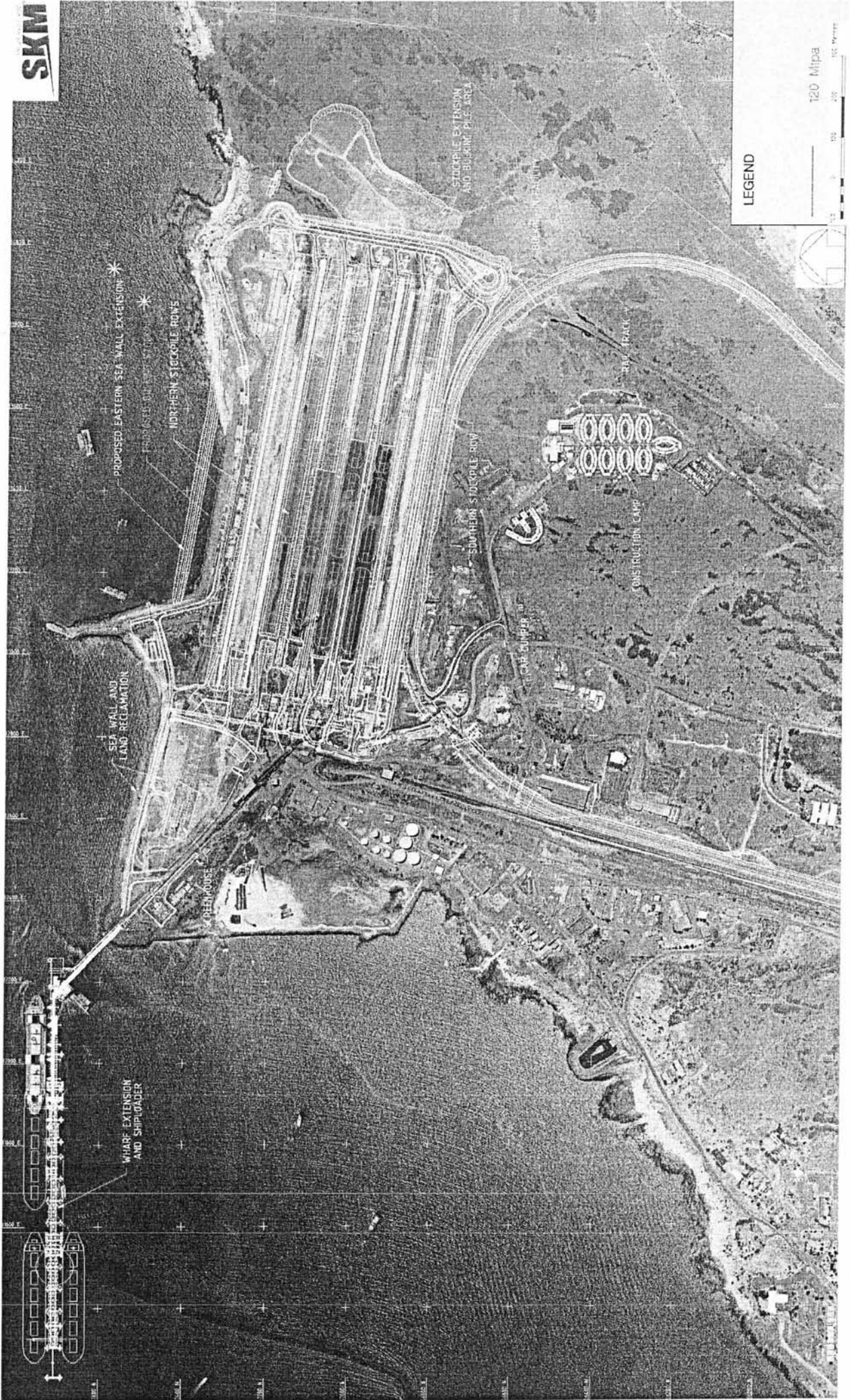
Figure 2: Dampier Operations – Parker Point Layout