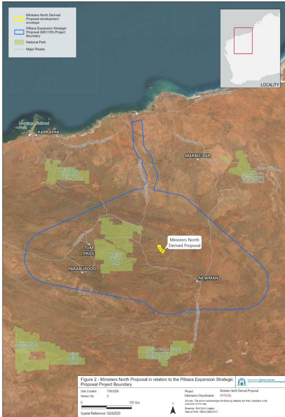
Figure 2: Ministers North (Derived Proposal) in relation to the Pilbara Expansion Strategic Proposal