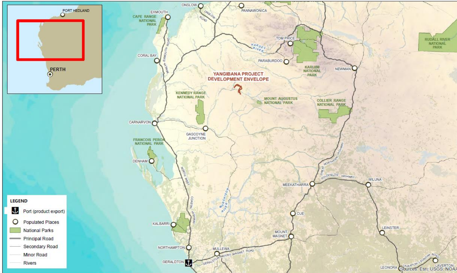
Figure 1 – Regional location

SCALE: 1:5,000,000 @ A4 COORDINATE SYSTEM: GDA 1994 MGA ZONE 50 PROJECTION: TRANSVERSE MERCATOR DATUM: GDA 1994 UNITS: METER