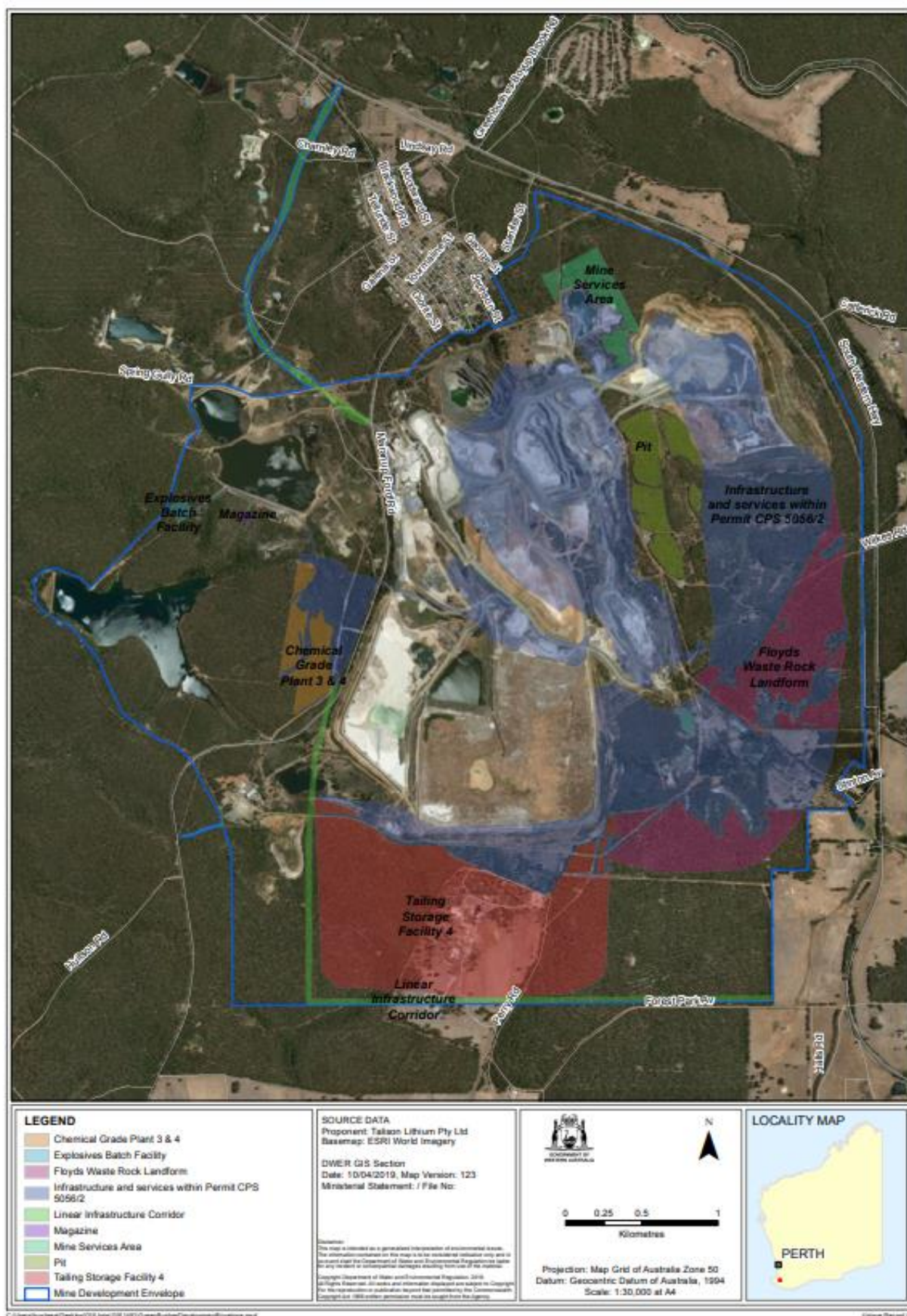
Figure 2: Mine Development Envelope