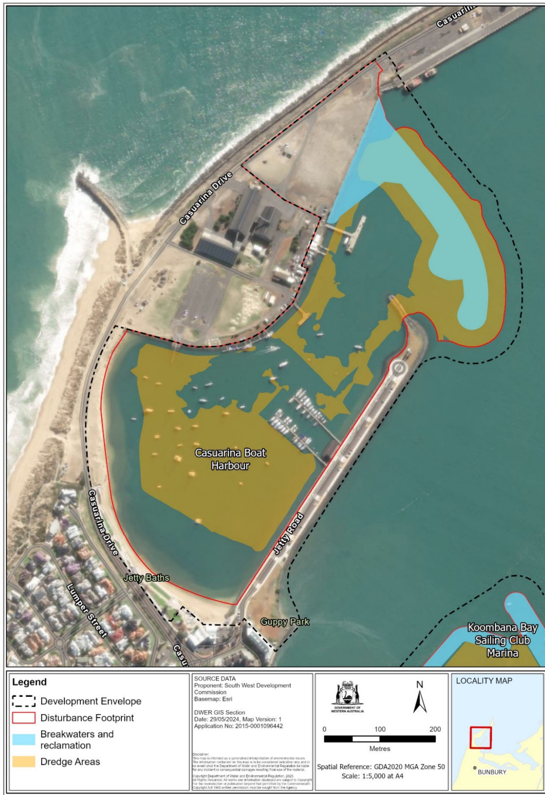
Figure 1: Casuarina Boat Harbour development envelope and disturbance footprint