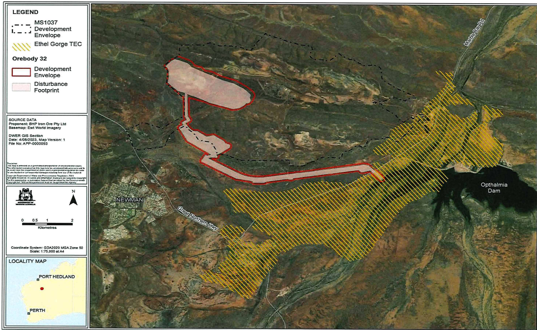
Figure 1: Orebody 32 Below Water Table Derived Proposal location