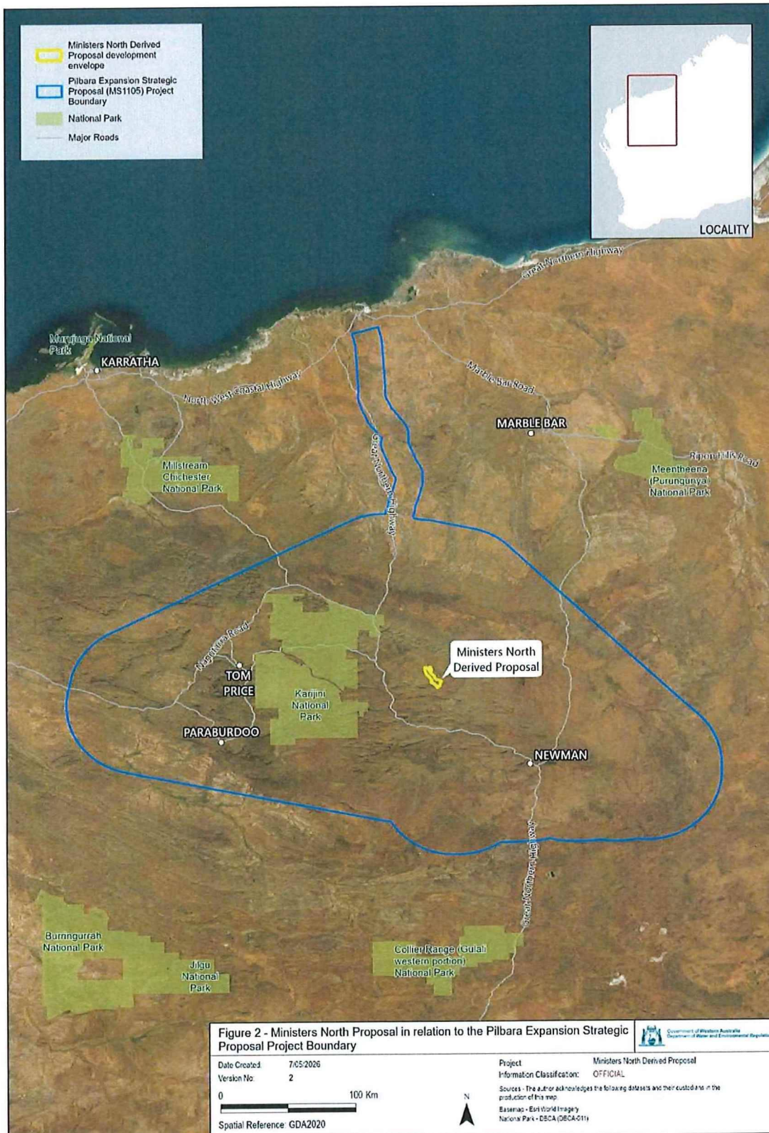
Figure 2: Ministers North (Derived Proposal) in relation to the Pilbara Expansion Strategic Proposal