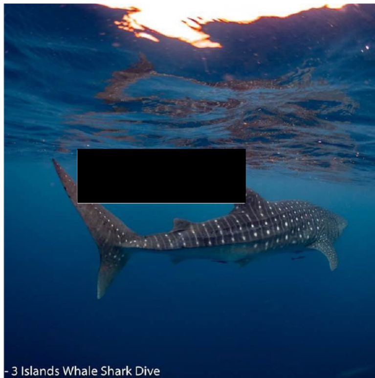
- 3 Islands Whale Shark Dive