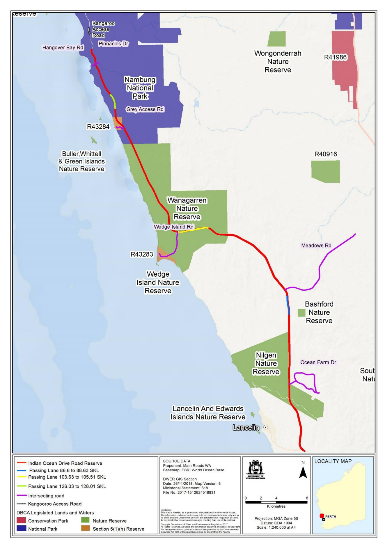
Figure 1 Lancelin to Cervantes coastal road, road connections and location of passing lanes