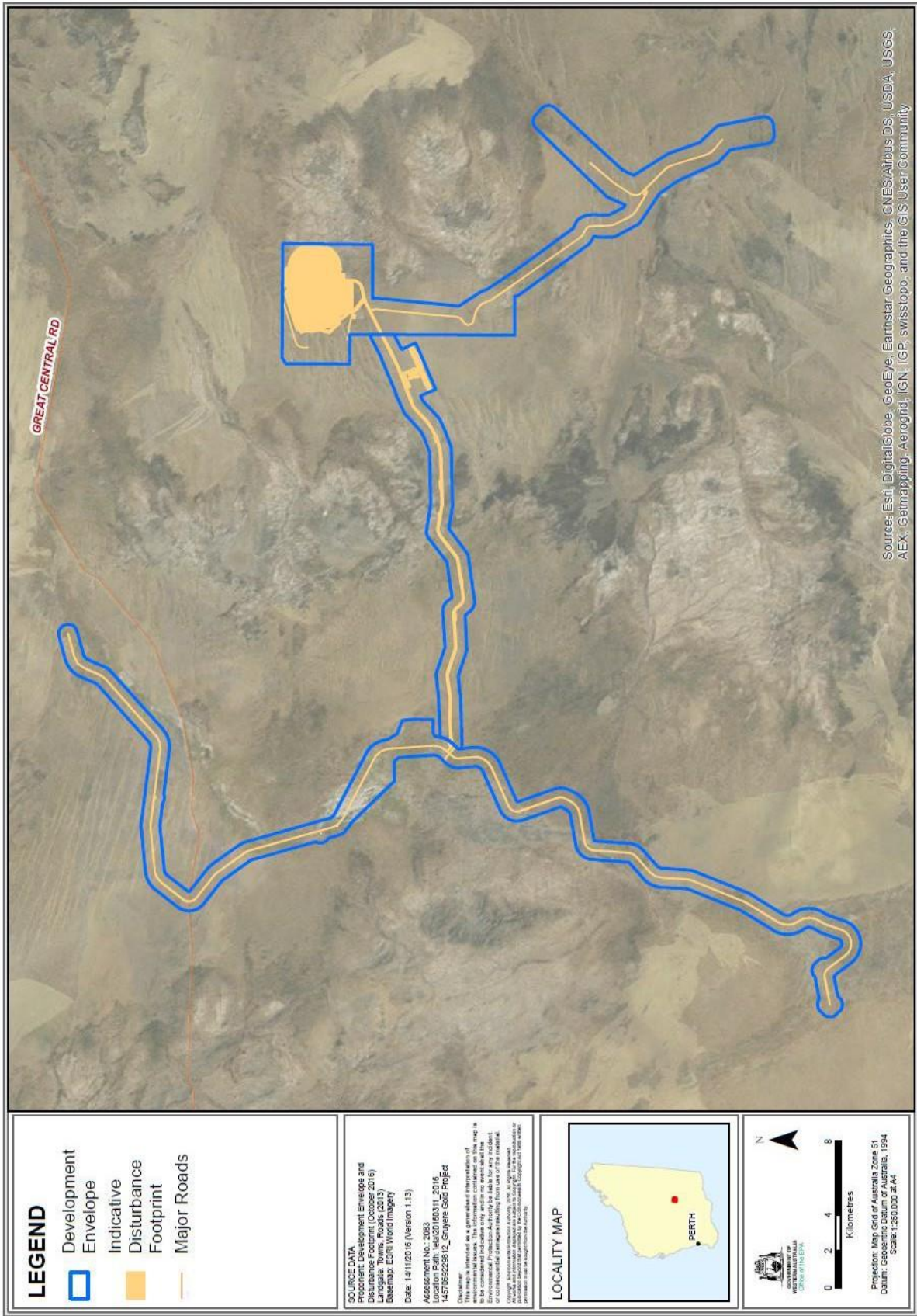
Figure 1: Gruyere Gold Project Development Envelope