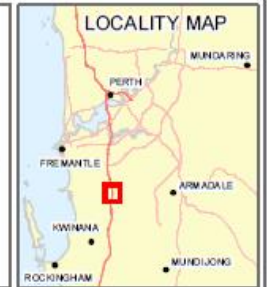
Figure 1 Widening of Kwinana Freeway: Armadale Road to Russell Road

Projection: Map Grid of Australia Zone 50 Datum: Geocentric Datum of Australia, 1994 Scale: 1:16,000