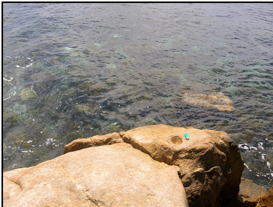
Figure 2 Skippy Rock grinding hole, for grinding berley to catch groper