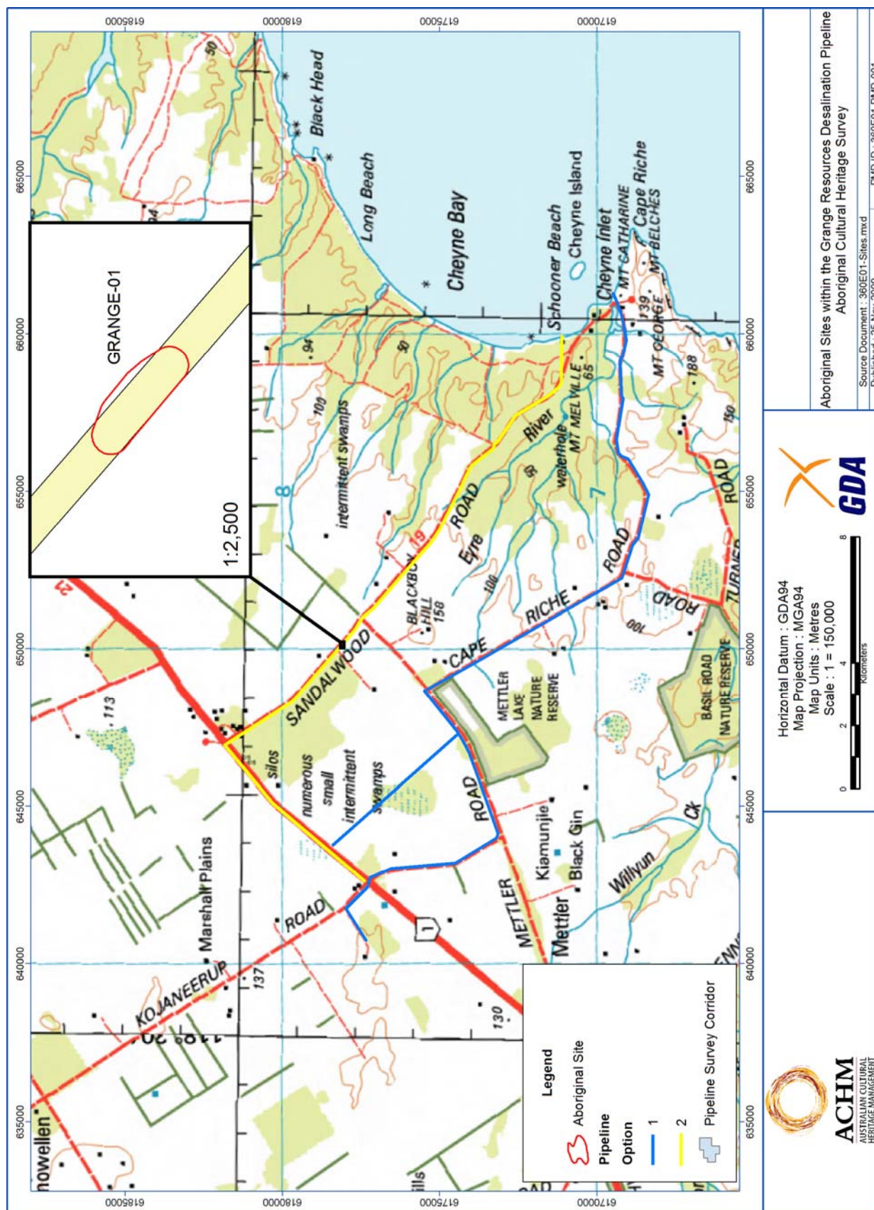
Figure 7 ACHM-GR-01 – Location along Option 2