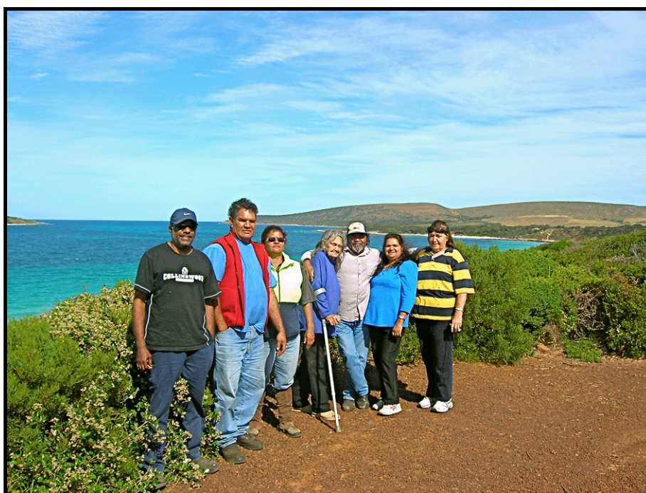
Figure 6 Noongar informants at Sandalwood Road car park, intake/outlet point, facing Cape Riche

In the case of all the other informants, stops were made whenever requested (see Figure 6), both at points directly concerned with each route and at other nearby places of importance such as the camping grounds on either side of the Eyre River and the old well area near the council caravan park. Each informant was given ample opportunity to comment on ethnographic matters as he or she saw fit.