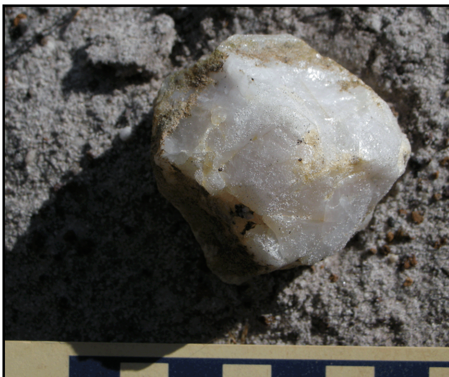
Figure 9 ACHM-GR-01 – Quartz bipolar core

• Adelaide • PO Box 451, Hindmarsh, SA 5007