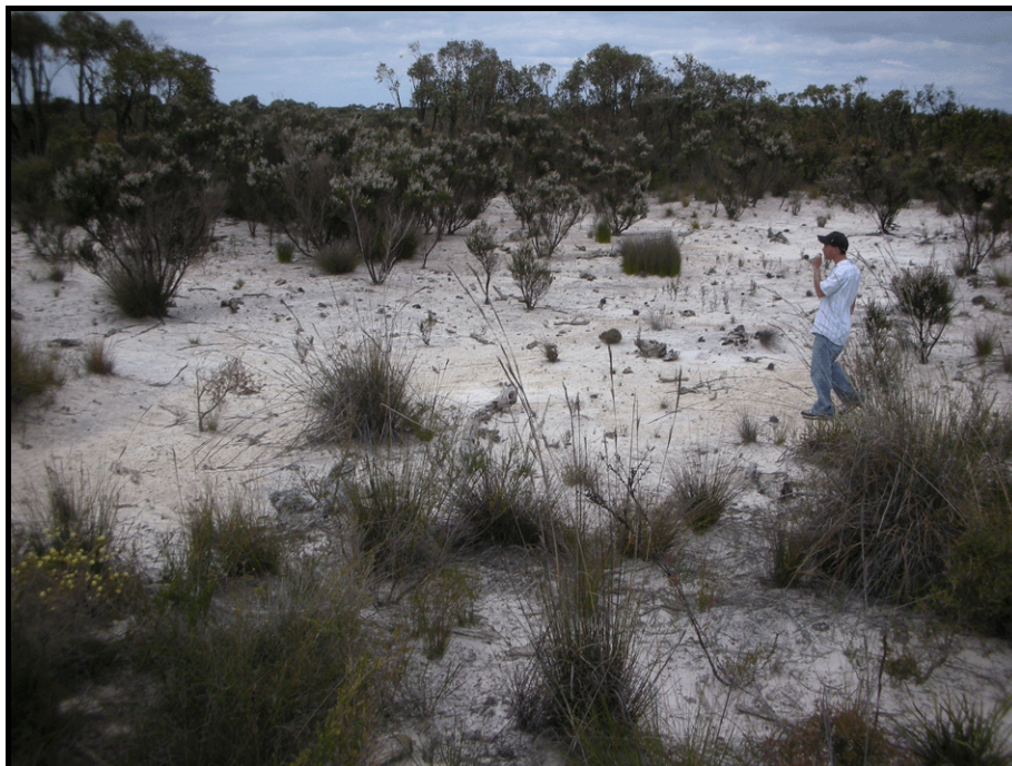
Figure 12 ACHM-GR-02 - View of sand dune containing chert core