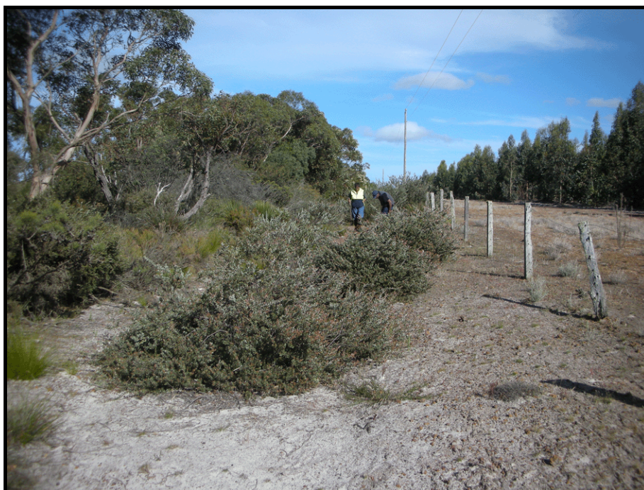
Figure 8 ACHM-GR-01 – View south across site