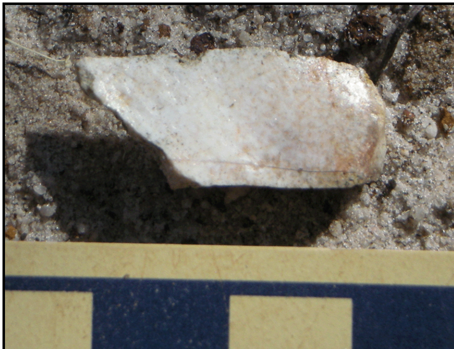
Figure 10 ACHM-GR-01 – Chert backed artefact