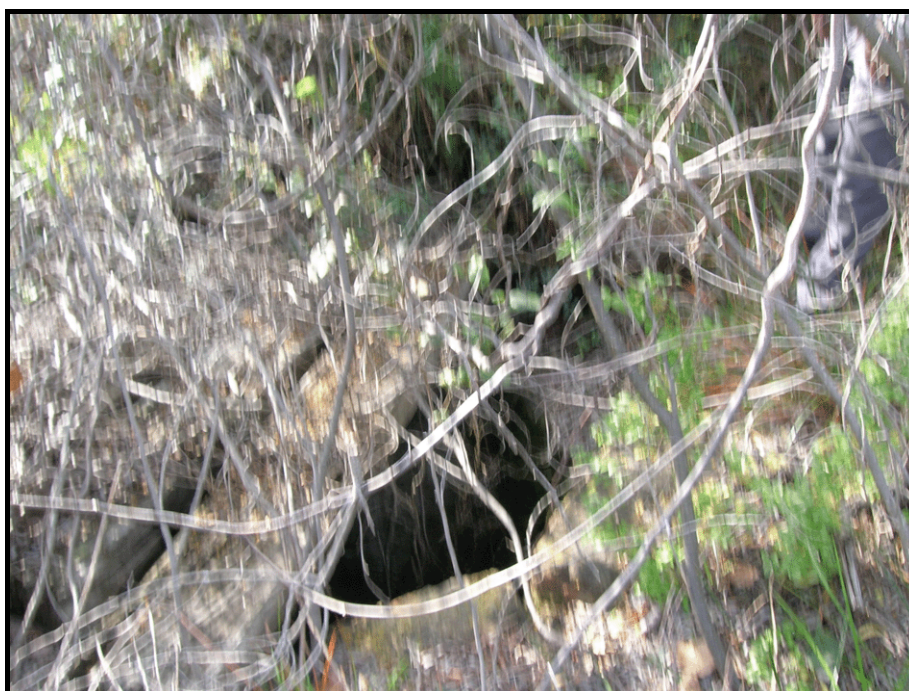
Figure 5 Noongar campground well, lined and deepened by early European settlers

• Adelaide • PO Box 451, Hindmarsh, SA 5007