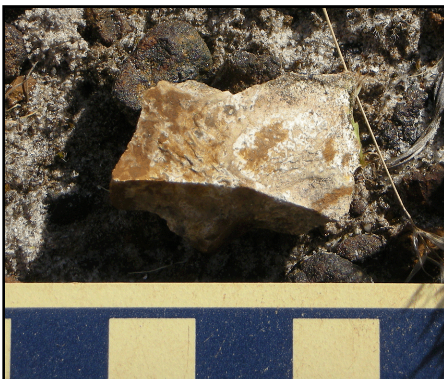
Figure 11 ACHM-GR-01 – Chert flake

• Adelaide • PO Box 451, Hindmarsh, SA 5007